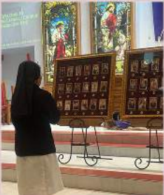
ST. JOSEPH SCHOOL MASS, VENERATION OF RELICS