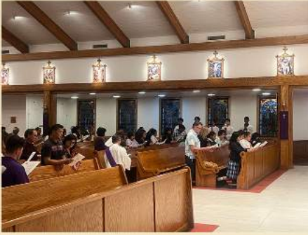
STATIONS OF THE CROSS MARCH 27, 2026