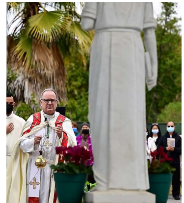
Parish dedication to St Joseph