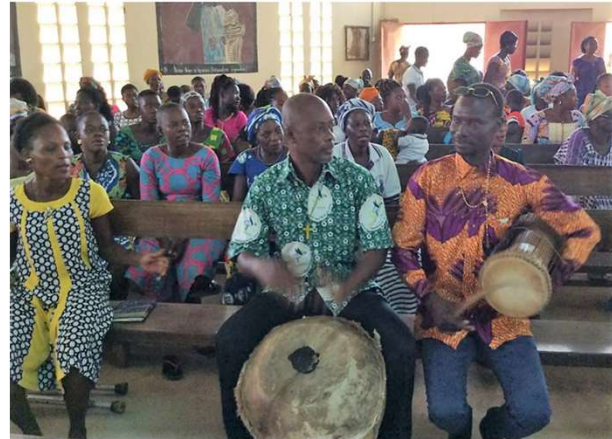
Our new Sister Parish: St Francis Xavier, Wiaga, Ghana

As Catholics, we believe in the dignity of every human being. Support for refugee families keeps families together and gives newcomers an opportunity to contribute and participate more fully in our community.