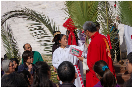
Chinese and Vietnamese Communities become part of St Joseph Parish