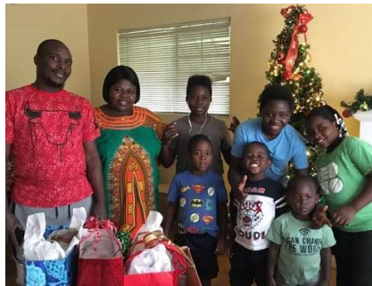
Refugee Assistance Ministry