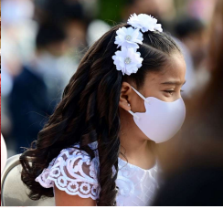
First Communion 2021