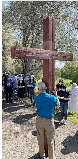
Lenten Stations of the Cross