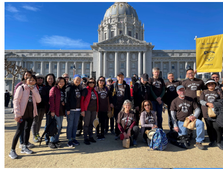
2022 Walk for Life