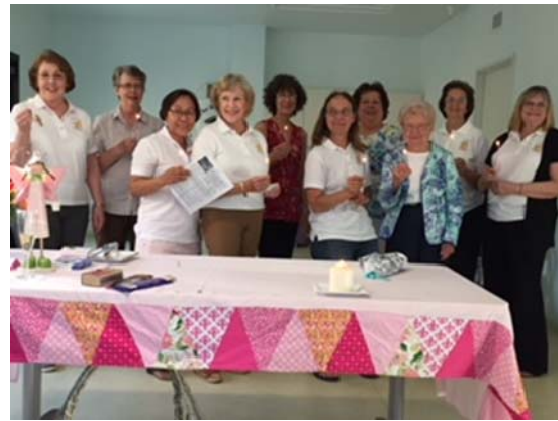
2018 EXECUTIVE BOARD AND COMMITTEE MEMBERS